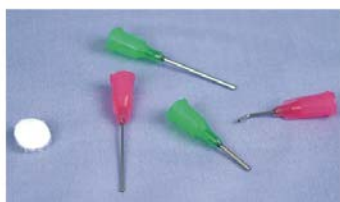
4 Vacuum Wand Tips & Drying Chamber Filter