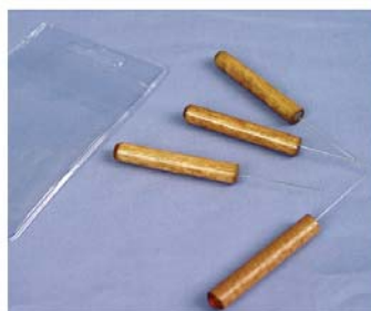
Cleaning Tool Kit