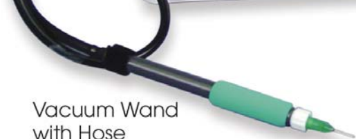
Vacuum Wand with Hose