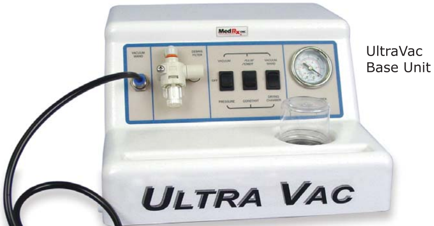
UltraVac Base Unit