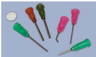
6 Vacuum Wand Tips & Drying Chamber Filter