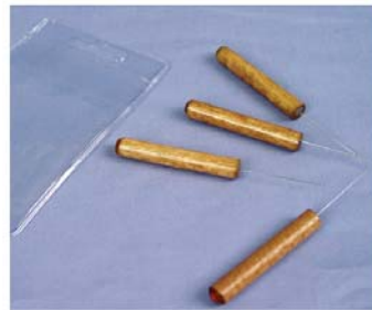
Cleaning Tool Kit