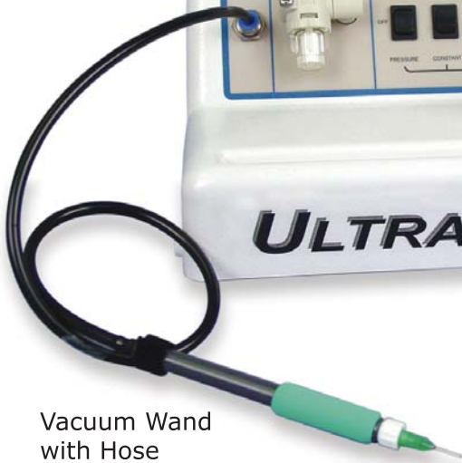
Vacuum Wand with Hose